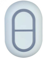
Wireless Panic Button